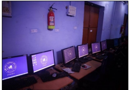
Almira, UPS with Batteries & and Computer Spares for Computer Laboratory