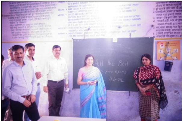
Black Board (Green colour) for class rooms