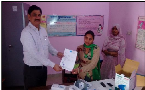
Storage Almira, Chair and Health Equipments