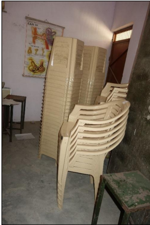
Plastic Chairs with Arms & Plastic Stools