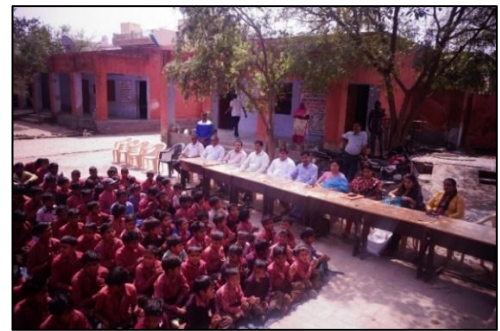
Carpets (Darri) and Tat petti