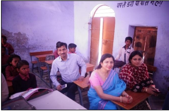
Dual Desk for 1 to 5 class students