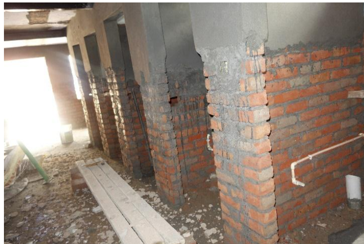
Girls Toilet