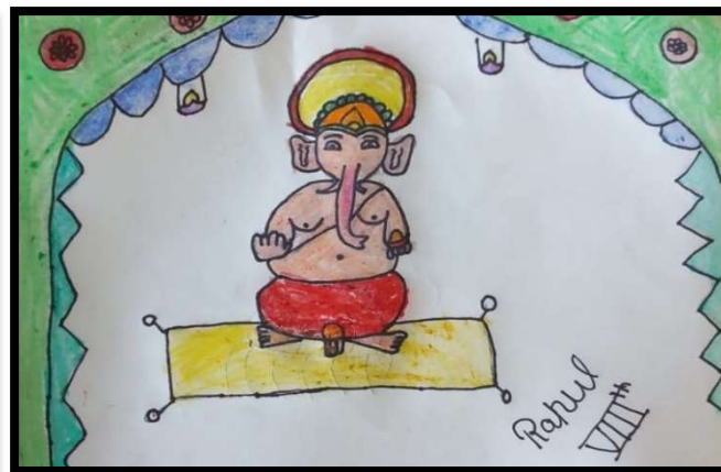
Ganesh Chaturthi Celebration