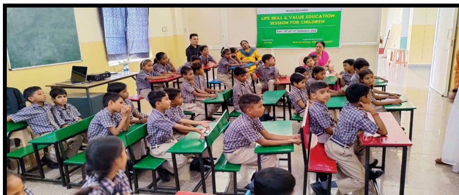
Students capacity Building

Secondary students were oriented about their duties and responsibilities with the help of stories, videos and activities. The videos showed the values and skills that make up character and good citizenship and how teachers can do to help the students develop strong character.