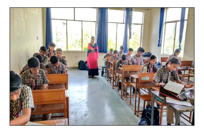
Glimpses of Assessment