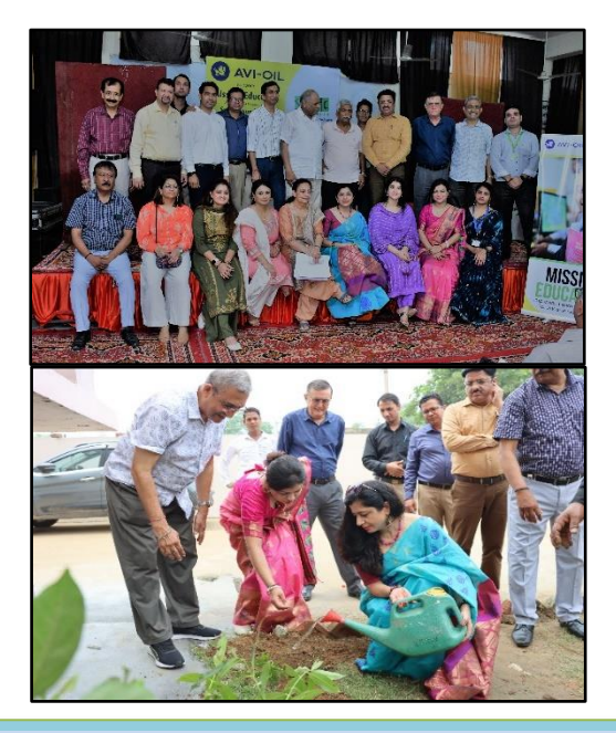
Glimpses of Employee Engagement