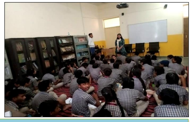
Glimpses of Life skill sessions for students